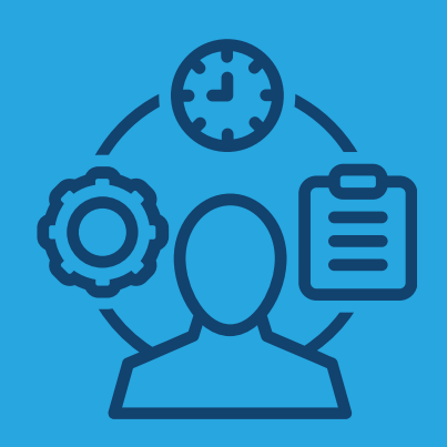
Helpdesk Orphanet Ireland contact point